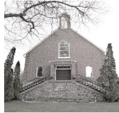
Our Lady of Mercy Church